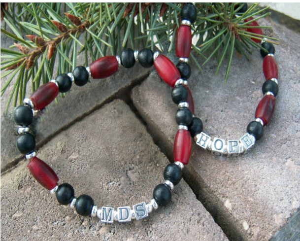
Men's Journey to Hope Bracelet