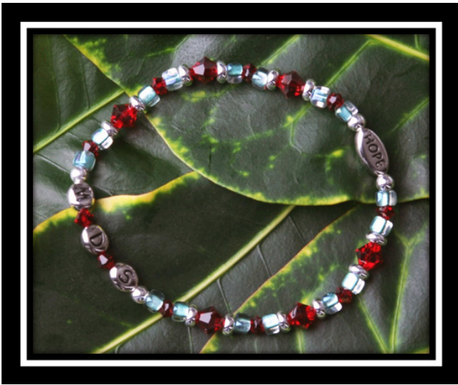
Women's Journey to Hope Bracelet